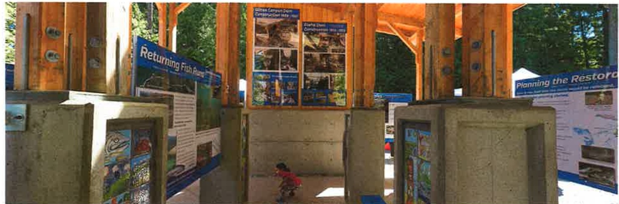
Above: People at the grand opening of the Elwha River Interpretive Center ... May 2016