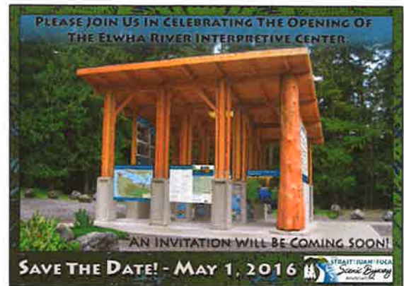
After the dam deconstruction crew left ... building the structure for the Elwha River Interpretive Center ... Grand opening May 1, 2016